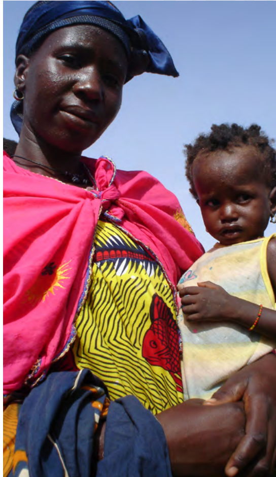
The unprecedented food crisis has impacted remote villages with devastating affects on children