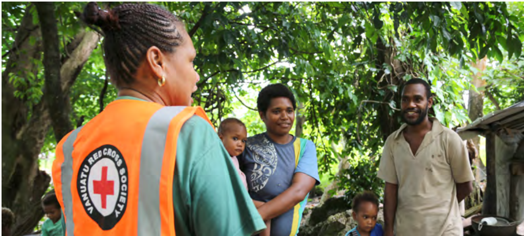
Red Cross staff visit villages to plan and prepare for emergency shelter when natural disasters strike