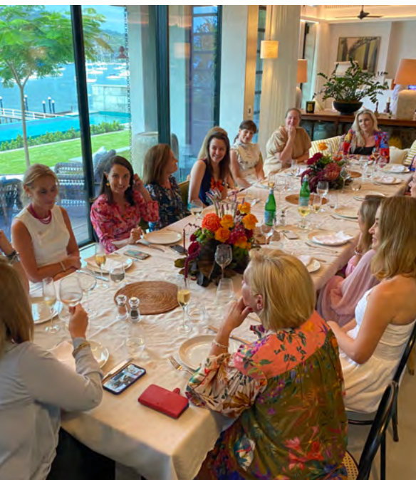
NSW members at Al Fresco Lunch