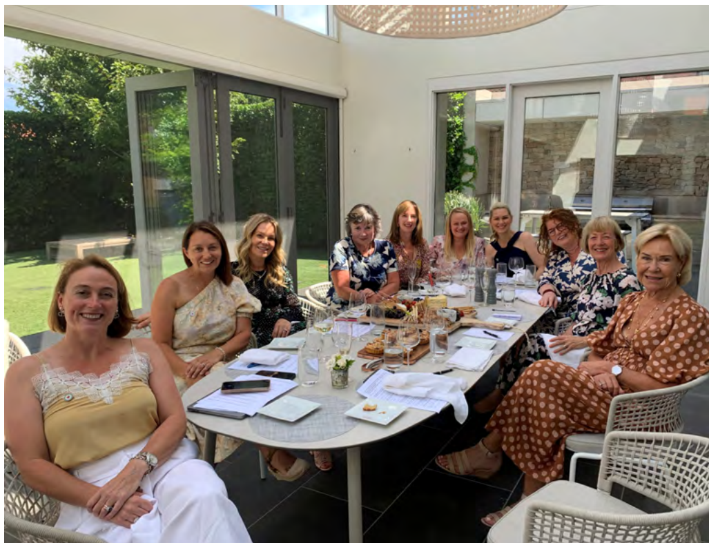
Al Fresco Lunch VIC