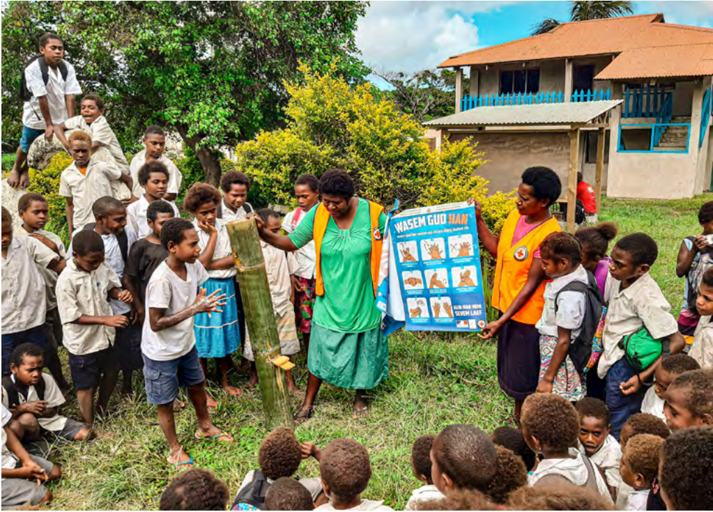
Vanuatu Red Cross provides hygiene workshops to children to enable healthy living practices