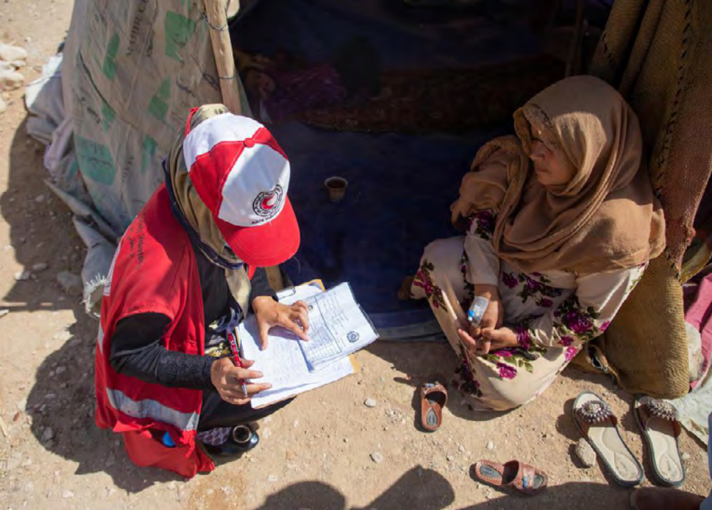
Red Cross staff and volunteers worked on the ground in communities to support those drastically affected by drought, conflict, COVID-19 and poverty