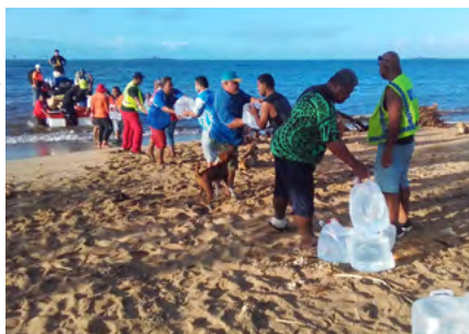
Red Cross staff and volunteers preparing to distribute clean drinking water