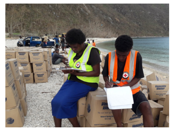
Hundreds of volunteers who came together in Vanuatu to rebuild their communities after a cyclone.

Thank you for your support of Australian Red Cross. It's helped more people than ever before. With your help, we can continue to be there to support people when times are tough, whenever and wherever they need it.