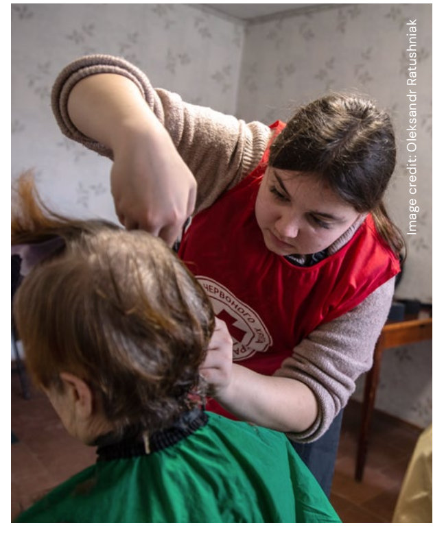
URCS Volunteers provide haircuts to those in need.