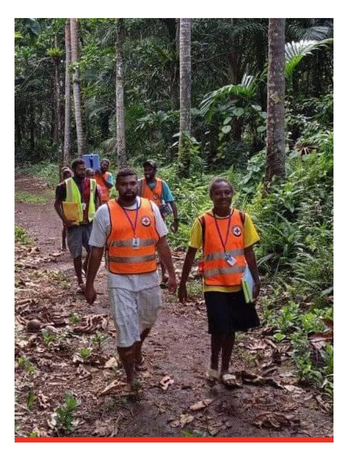
Vanuatu Red Cross volunteers travel to remote island communities to assist with COVID-19 vaccinations.

Fiii RCS and Vanuatu RCS mounted effective responses to Cyclone Harold with mainly online support. Their personnel were able to mobilise more assistance from local communities than would have been likely in an operation run mainly by internationals. This suggests that building local capacity and reducing on-the-ground surge support could potentially improve disaster responses and increase value for money. NS are clearly capable of taking a more active role in planning and management. This should provide an incentive for donors to invest more in developing local capacity and moving towards more equal partnerships with NS (See ARC 2020 for an analysis of Fiji and Vanuatu NS responses to Cyclone Harold).