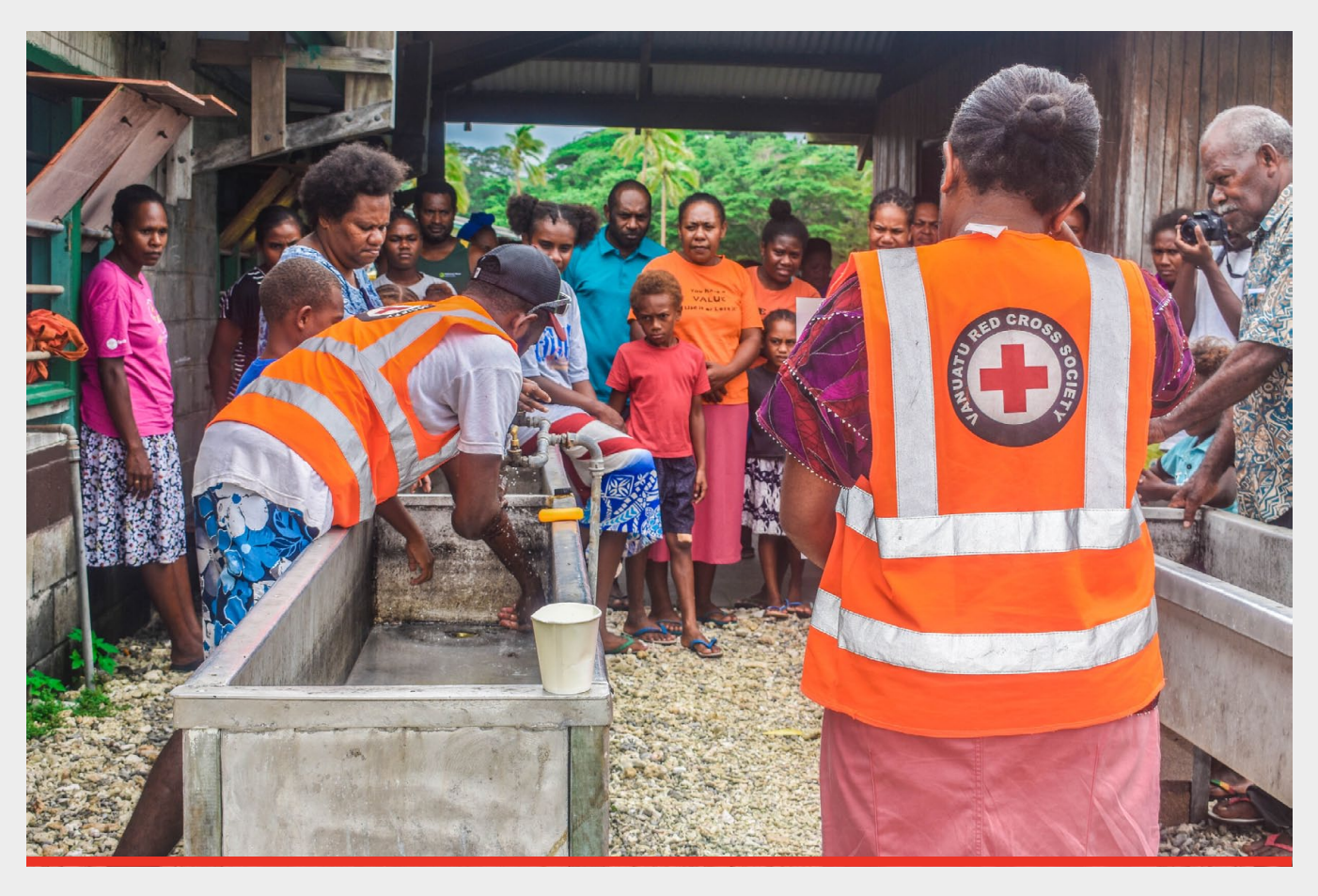
A Vanuatu Red Cross volunteer conducts a handwashing demonstration.

New Zealand: New Zealand is a smaller but important donor to the Pacific region, with small programs elsewhere. In 2019-20, the New Zealand Aid Programme provided $426 million in bilateral aid to Pacific countries, of which $NZ 48 million was repurposed to support the Pacific response to COVID-19. New Zealand also contributed around $190 million to multilateral agency partnerships, Cyclone Harold and to support Samoa through its 2019-2020 measles crisis (NZMFAT 2021).