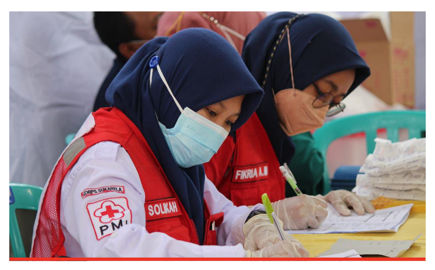
The Indonesian Red Cross Blitar branch supported the Government of Indonesia in accelerating the COVID-19 vaccine rate in order to curb the pandemic. Indonesian Red Cross Society

While expectations of economic recovery across the Asia Pacific region have been largely positive, its timing remains uncertain as new variants of COVID-19 cause further waves of morbidity and mortality, and the long-term effectiveness of COVID vaccines is not yet known. Improving COVID-19 vaccination rates could expedite economic recovery but are not a panacea.