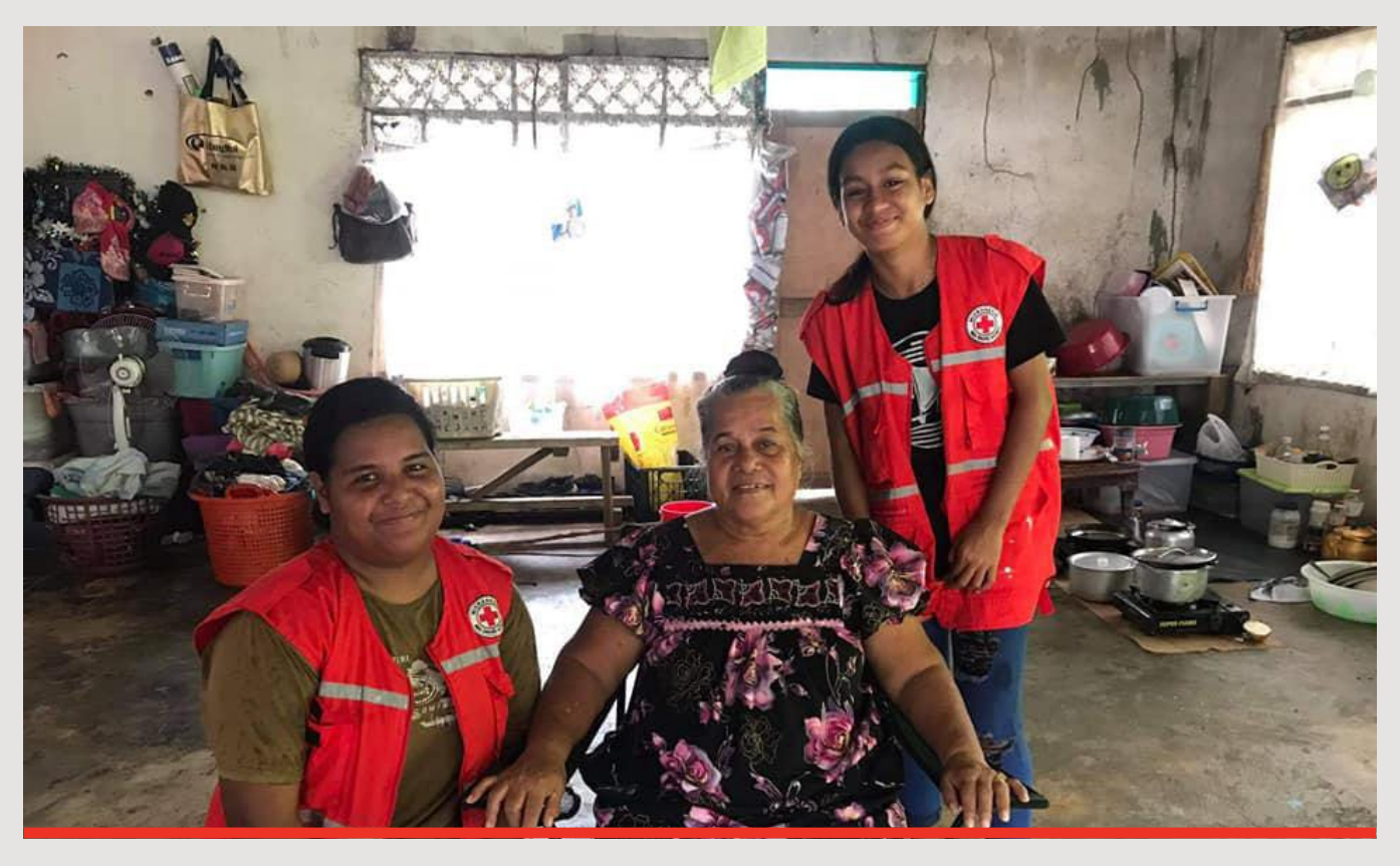
Micronesia Red Cross volunteers conducting COVID-19 awareness in remote communities across Pohnpei. Micronesia Red Cross Society