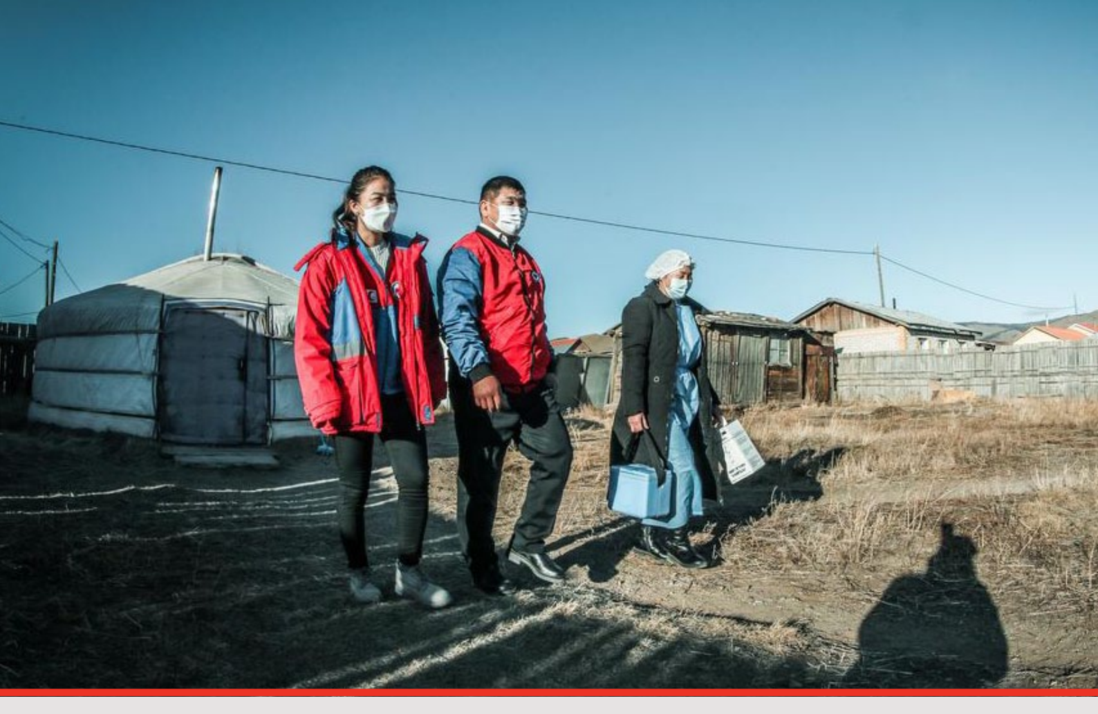
Mongolian Red Cross volunteers visited people who were isolated and alone due to COVID-19 lockdowns and movement restrictions.