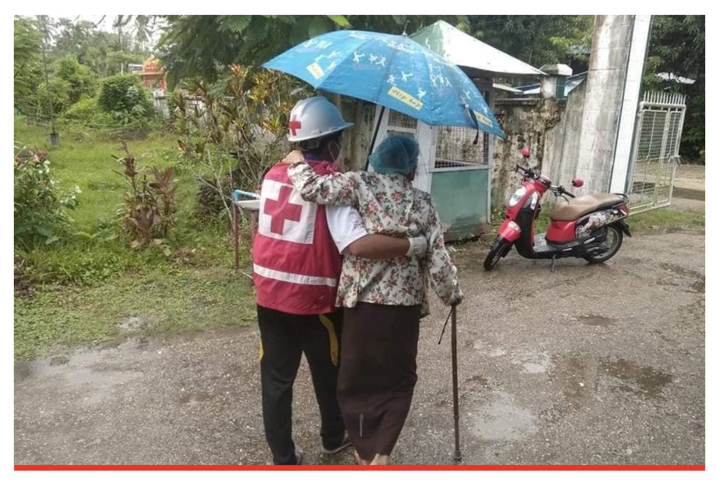
6,000 Myanmar Red Cross volunteers joined the effort to protect their communities from COVID-19.

One third to half of staff and volunteers in Mongolia contracted COVID-19, while informants from Mongolia RCS said staff and volunteers were working up to 15 hours a day, seven days a week, because of staff shortages and extra workloads during the double emergency of extreme cold weather and the pandemic.