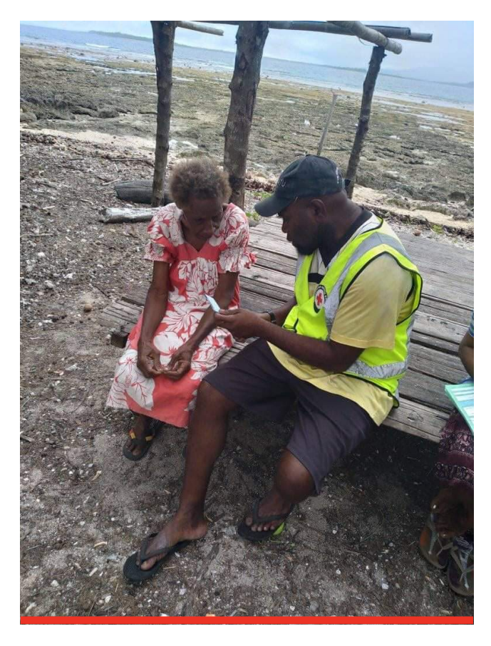
A Vanuatu Red Cross volunteer providing critical information about COVID-19 vaccines to a community member. Vanuatu Red Cross Society