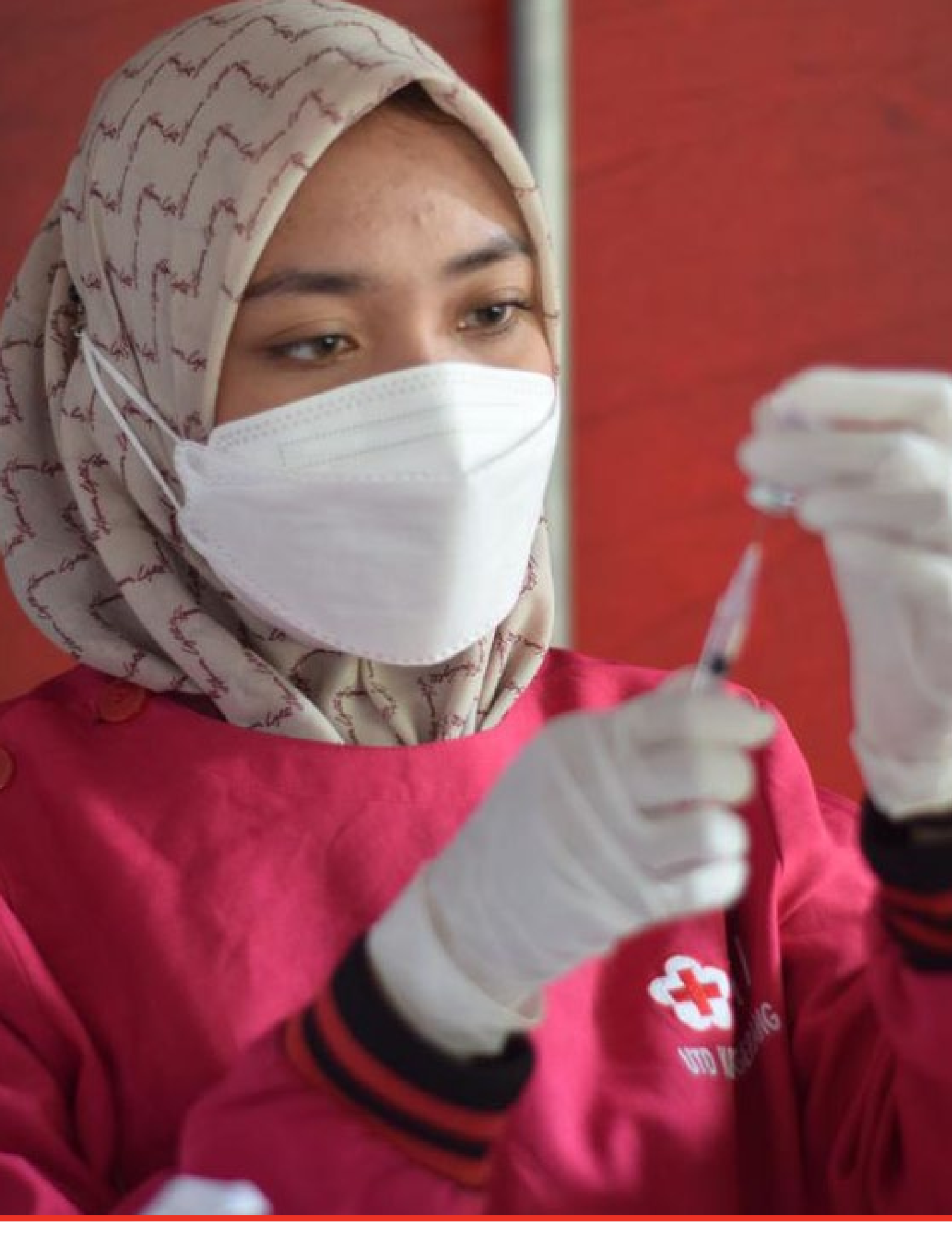
The Indonesian Red Cross has been supporting the Government of Indonesia in accelerating the COVID-19 vaccine rate to curb the pandemic. Indonesian Red Cross Society