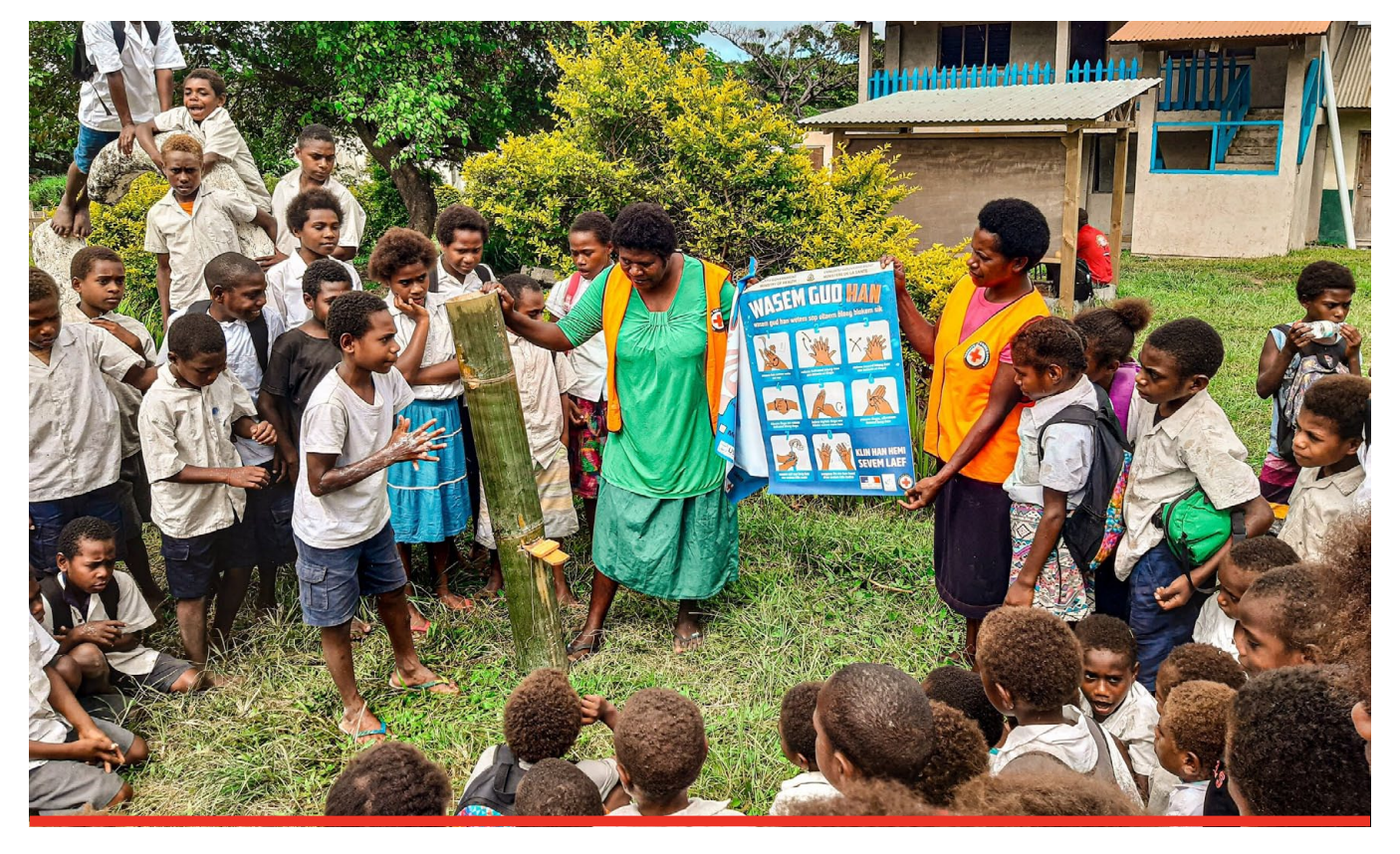
Vanuatu Red Cross volunteers teach children handwashing tips. Vanuatu Red Cross Society