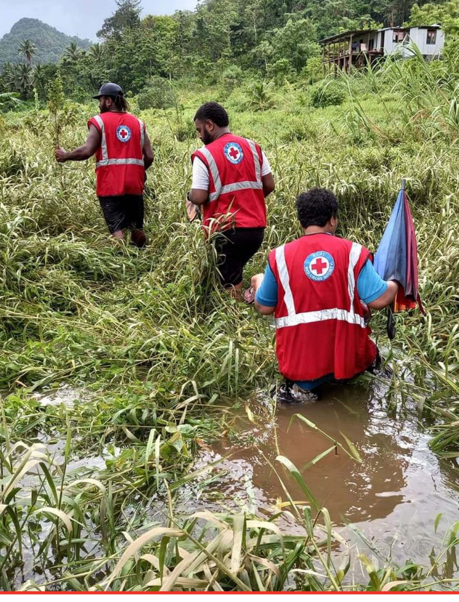
Fiji Red Cross volunteers travel to communities affected by Tropical Cyclone Cody in January 2022. Fiji Red Cross Society