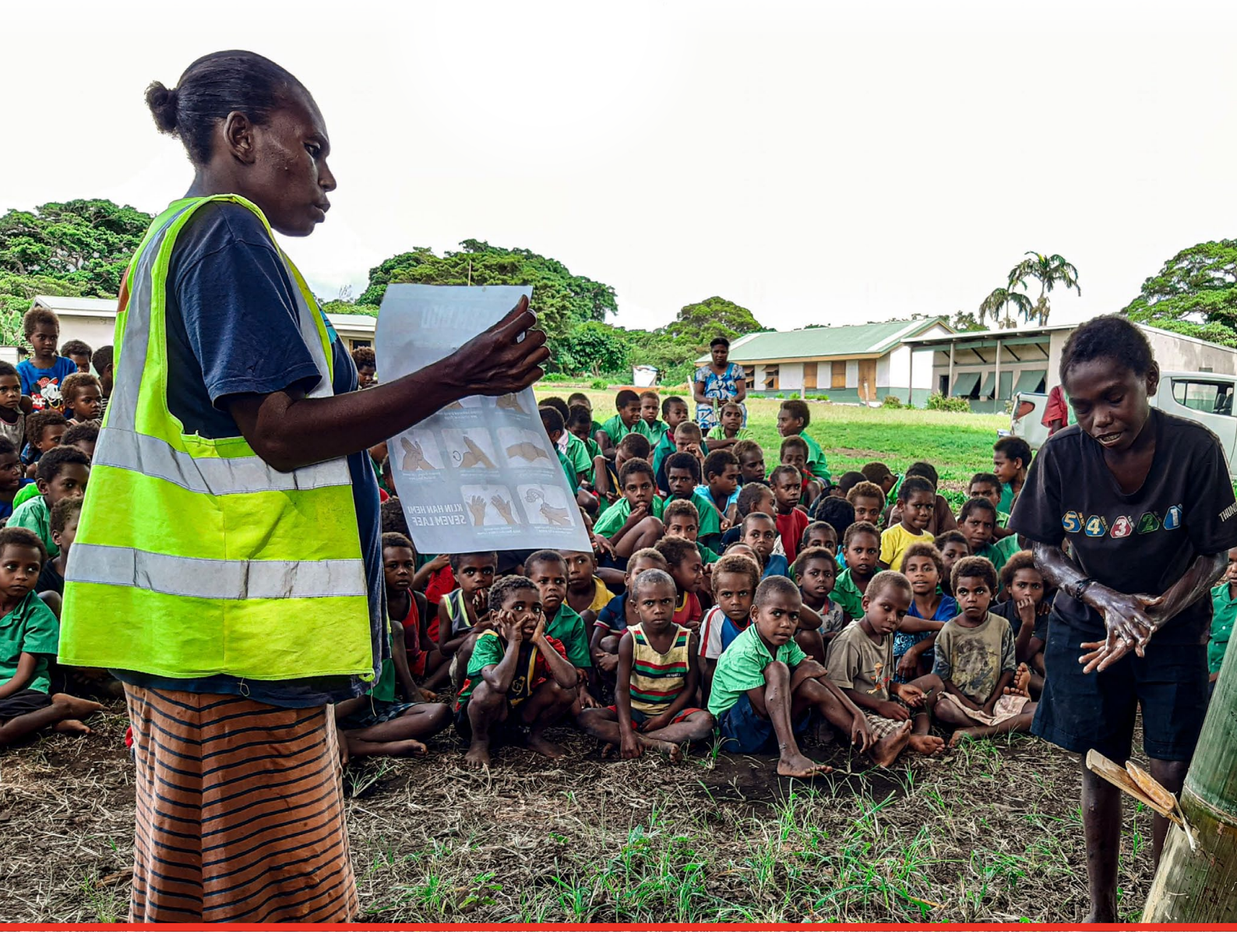
Vanuatu Red Cross volunteers teach children handwashing tips.

Border restrictions brought the tourist industry to a standstill and restricted opportunities for seasonal and contract work in Pacific Rim countries. In 2019-2020, some of the world's highest percentage contributions of remittances from diaspora to home country GDP were in Tonga (38%), Samoa (19%) and Marshall Islands (13%), while most other Pacific countries also received significant revenue from remittances. Suspension of seasonal worker programs during the pandemic adversely impacted the employment and earnings of Pacific migrant workers. This means fewer remittances to family in home countries, with major implications for their household incomes and capacity for business development.