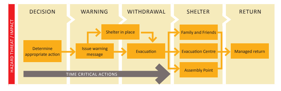
Figure 2. Five stages of evacuation. Reference: Queensland Evacuation Guidelines, 2011<sup>1</sup>.

In response to a threat, government authorities will initiate a five-stage evacuation process. The first three stages involve determining appropriate action in relation to the emergency, issuing warnings and evacuating. Shelter is considered the fourth stage and includes community members accessing safety, including in nominated safer locations away from the potential hazard or area of impact. Return is the final stage in the evacuation process which requires the careful planning and management of people in the return to their homes and community.