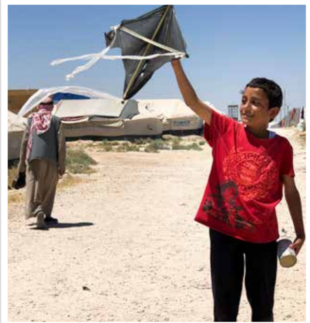
Photo: North East Syria, Al Hassakeh Governorate, Al Hol camp for internally displaced persons

The sick and wounded must be cared for humanely and without distinction. Medical personnel, hospitals and ambulances must never be targeted. They must be respected and protected. The distinctive red cross, red crescent and red crystal emblems and other officially-recognised symbols indicate that the building displaying the emblem, or the person wearing it, must not be attacked.