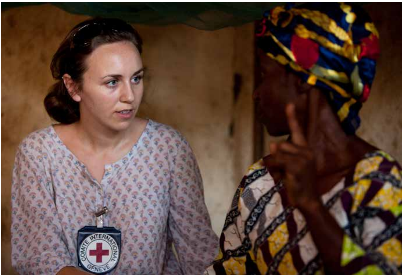
Photo: Bangui, Bimbo women's prison. An ICRC delegate talks to a detainee

As a testament to the accepted nature of these laws, all countries have ratified the Geneva Conventions, and the vast majority are parties to the 1977 Additional Protocols.