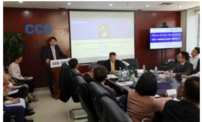
ICRC President, Peter Maurer, addresses representatives of Chinese business community

Moreover, business activities may be considered ‘closely linked to an armed conflict’ even if they do not take place during actual fighting or on the physical battlefield and even if the business did not actually intend to support a party to the hostilities. Given the difficulty in determining which business activities are or are not ‘closely linked to an armed conflict’, prudent corporate risk management would suggest a cautious