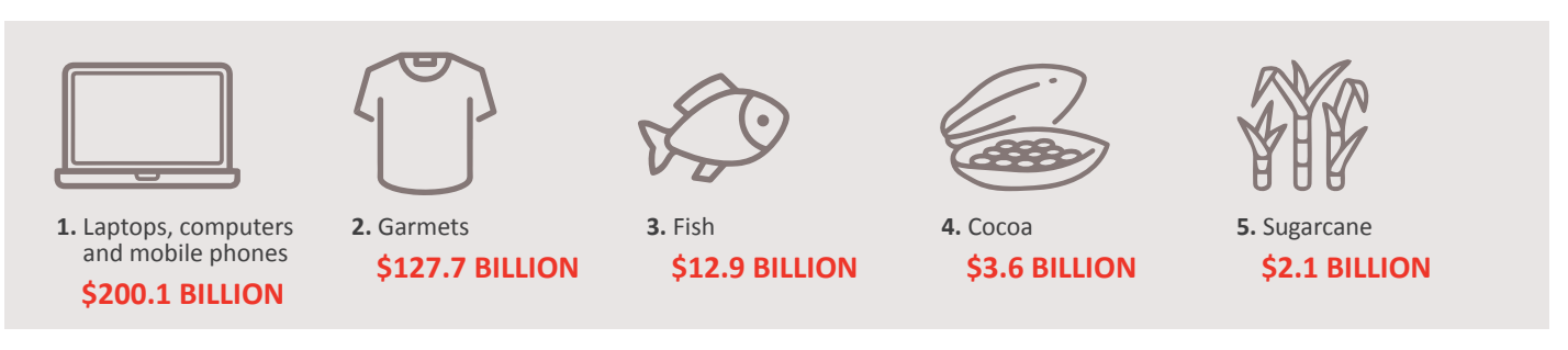
Figure 2: Top 5 products at risk of modern slavery imported into G20 countries, by US dollar value<sup>3</sup>

The construction industry accounts for 18 per cent of labour exploitation cases. Employment conditions are notoriously dangerous and demanding, with a high incidence of industrial accidents.