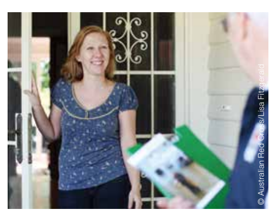
Right: Keep things local. Far right: Recovery takes a long time.