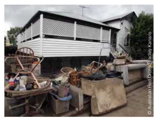
Right and Far Right: Responses to disaster work well when they draw upon existing social capital.