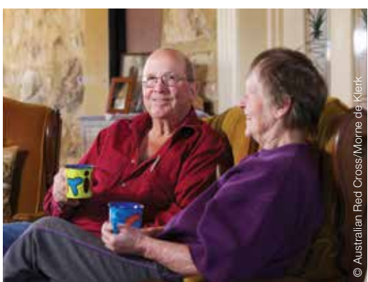
Far Left: Awareness and participation is the key to resilience.

would be recognised, whilst still offering invaluable support in areas of difficulty identified by communities themselves. This can be challenging where linking social capital is weak, and the relationship between government agencies and communities is poor. This concept can also be challenging when policy makers and decision makers are pressured into quick decisions, for fear of being portrayed as slow or indecisive, often opting for centralised control models of taskforces or authorities.