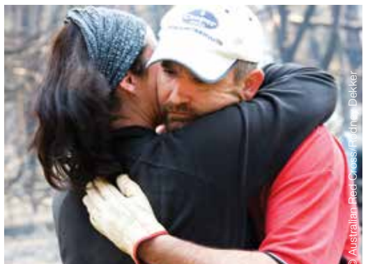
Right and Far Right: Community engagement is a two way street.