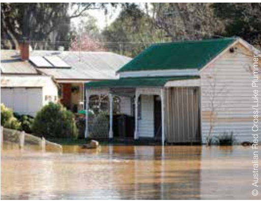
Far Left: Recovery Centres support and enable stretched community networks.

Left: Flood have insidious intangible impacts.